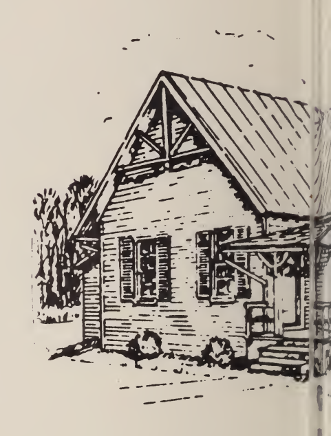
Ashton Meeting Hou., in School Campus in 198 for Methy

Moreover, Quakers were the first religion to recognize the equality of women and men. Since our beginning, almost 350 years ago, Quaker men and women have shared equally in the work of Friends, and Quaker schools have educated both girls and boys.